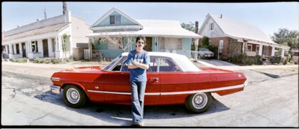
untitled, Douglas, Arizona, 1979

Arizona Unseen, Color Photography 1978 - 1988, Archival Pigment Prints, Oct 24 - Dec 16, recep- tion: Nov 3, 5-7pm.