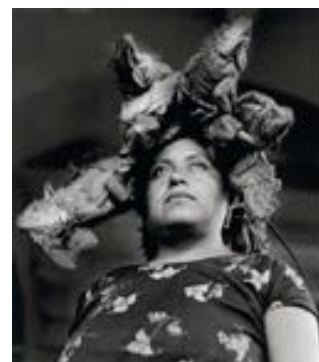
Graciela Iturbide, Nuestra Señora de las Iguanas, Juchitán, Oaxaca ( Our Lady of the Iguanas, Juchitán, Oaxaca), 1979, gelatin silver print, © Graciela Iturbide, courtesy Etherton Gallery

ethertongallery.com 135 S. 6th Ave; 624-7370