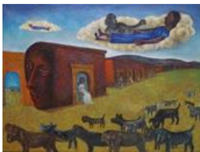
Rodolfo Morales, Untitled , oil on canvas