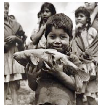
Masao Yamamoto, #1684 from Kawa=Flow , 2016, gelatin silver print with mixed media, © Masao Yamamoto, courtesy Etherton Gallery

Mementos : Rodrigo Moya, Graciela Iturbide, Masao Yamamoto, photographs; Jan 9- Mar 3; reception & book signing Jan 13, 7-10pm. In-house Pop-Up: Rhod Lauf-fer