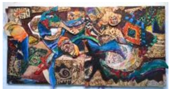
Albert Kogel Rectangle , 2017 painted, carved wood