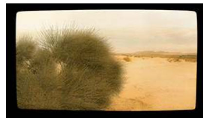
Keith Marroquin, Ephedra photograph, wood, plaster