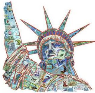
The Enduring Hope , 2017

In This Together: 60 years of daring to create a more perfect Arizona . Group exhibition touring AZ. Opens at