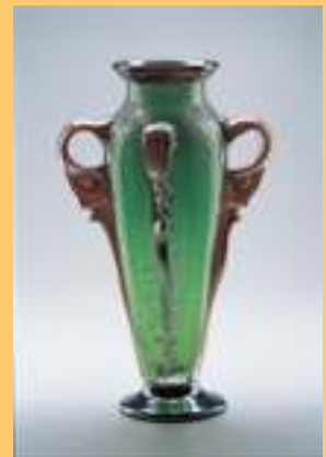
Tom Philabaum Green Venerable Vessel blown glass