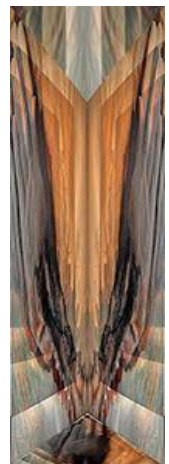
Human Impact Mirrored and Stretched

4 Artists , transluents, Yun Gee Park Gallery & Atelier, 4226 E. 2nd St, Sep 21 - Nov 10; reception Oct 27, 6-9p.