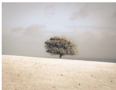
Lone She-Oak Tree by Ocean, Kangaroo Island, South Australia (n.d.) hand-colored, archival pigment print

Kate Breakey: Trees , mixed media photographs, Legacy Gallery, Tucson Botanical Gardens, 2150 N. Alvernon, Oct 1, 2018 - Jan 13, 2019.