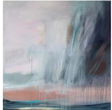
Desert Fury , acrylic

Sunrise or Sunset , group show, Herberger Theatre Center Art Gallery, 222 E.