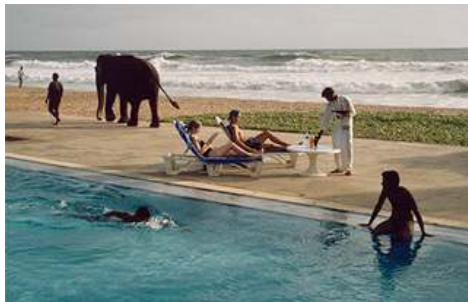
Tourists at a Resort, Bentota, Sri Lanka, 1995 Fuji Crystal Archive print