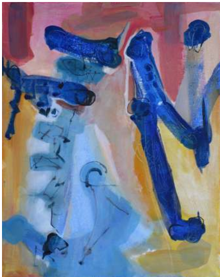
Fran McNeely, Fish-Nada , 2019 acrylic on canvas

An exhibition of CAS Artists at the Visual Arts Gallery, Pima Community College West Campus