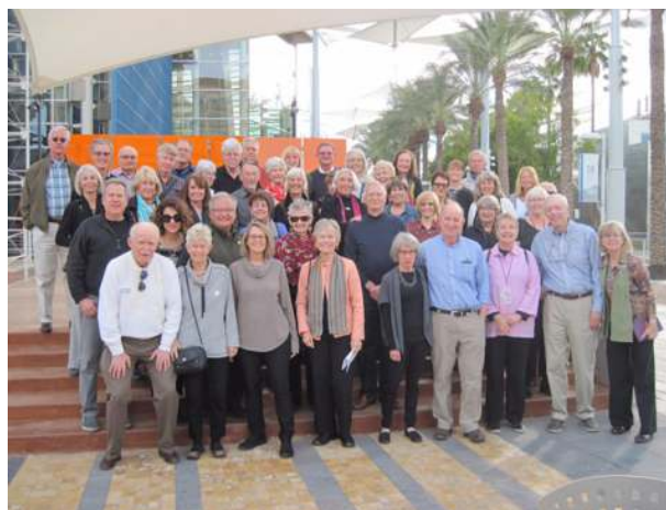
CAS members assemble during annual trip to Phoenix